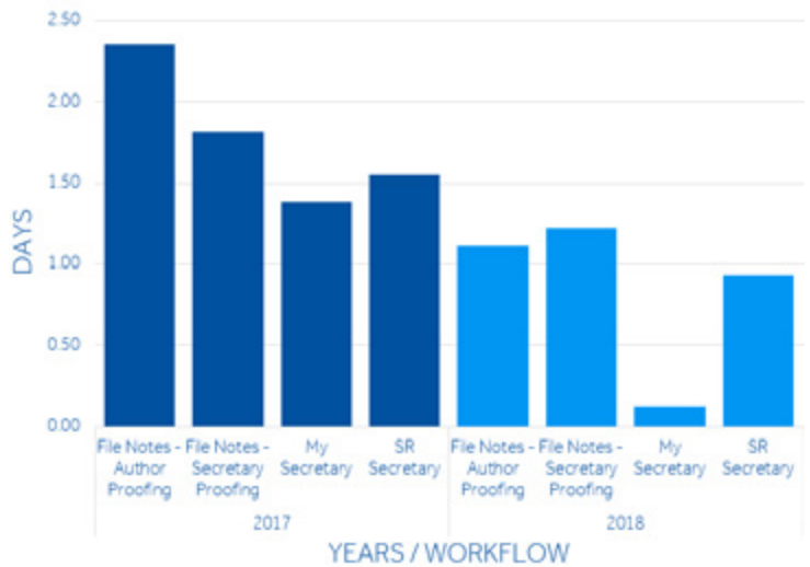
AVERAGE TURNAROUND BY WORKFLOW (DAYS)

Wedlake Bell has reported an incremental decrease in turnaround times of all dictations, with efficiency increasing by 49.89% from April 2017 to February 2018.